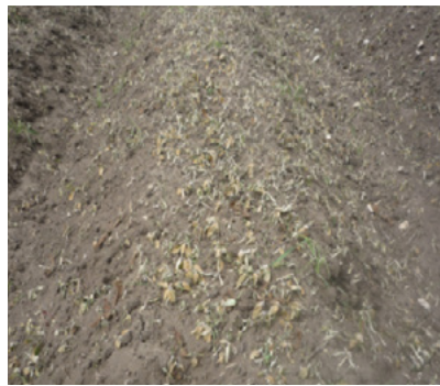
Shark® 0.33L 3 days after application