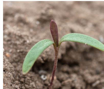
Black Bind Weed

Shark®, containing the active ingredient carfentrazone-ethyl, is a fast-acting broadleaved weed herbicide for use in potatoes before emergence. This contact acting herbicide has excellent activity on a wide range of weeds including polygonum species, fathen, volunteer oilseed rape, cleavers and annual nettle. Shark is a highly flexible product as it is rainfast in 1 hour and is compatible with all residual potato herbicides allowing effective control in the potato crop before weeds start to compete.